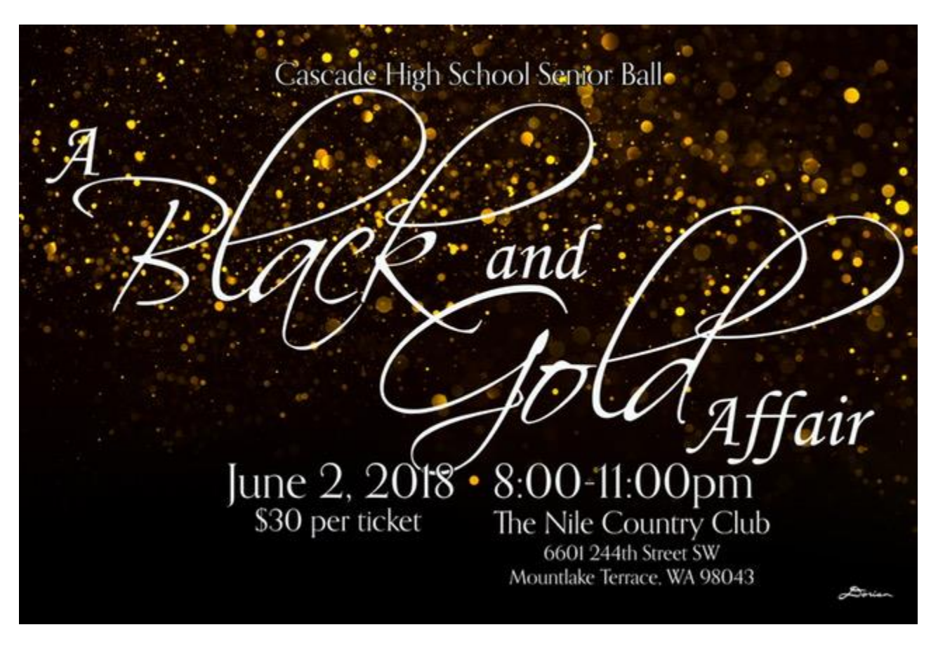
Senior Ball Tickets are on sale May 16 through May 25 Senior Ball Guest Form